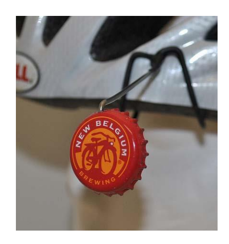
Sunglass Mirror Helmet Mirror

Thank you for purchasing a Rear View Mirror. The mirror is made in 2 types, Helmet and Sunglass Models. When properly adjusted, a simple twist of the head from 10 to 15 degrees is all that is necessary to see what is behind you.